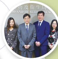
Interview of Dr Ko Wing-man BBS JP